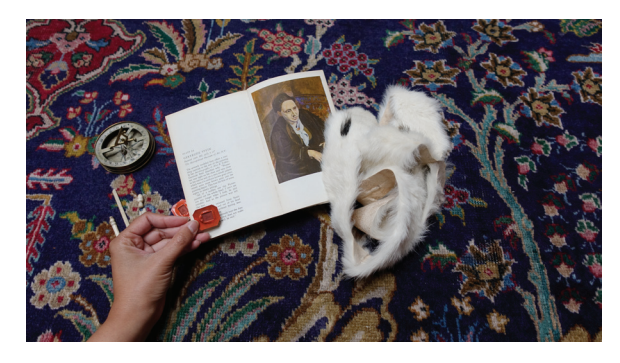
Erika DeFreitas, She may be moved and they multiplied most in exaggeration. , 2018.

photographs called She may be moved and they multiplied most in exaggeration.