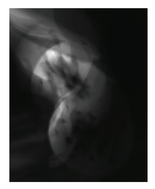
Erika DeFreitas, May they or may they seize, 2019.